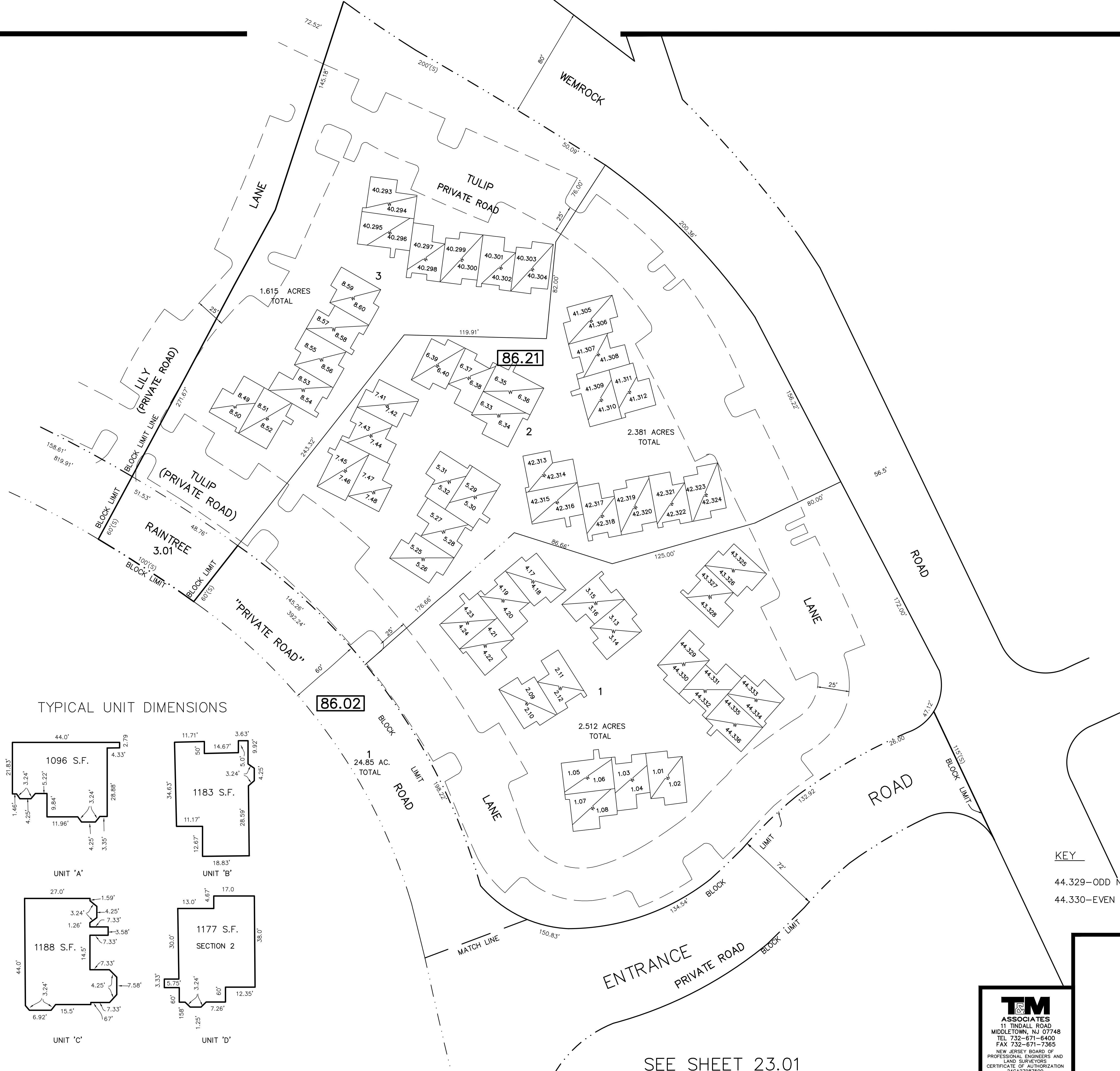
TYPICAL UNIT DIMENSIONS